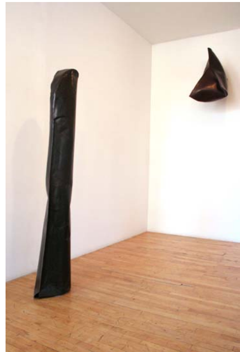
Structures I - II, 2008

Connu pour ses interventions architecturales dans des immeubles qu'il récupère, Jacques Bilodeau poursuit ses recherches, depuis quelques années, dans ce que l'on pourrait appeler une «architecture molle». Délaissant les matières dures au profit de matériaux souples, il conçoit des objets sculpturaux ayant comme caractéristique de se mouler au corps des spectateurs transformés en utilisateurs : la série des Transformables (2004-2006), la Tour molle (2007), et Cellule I (2007). Les Structures (2008), rappelant le « punching bag » par leur forme, leur consistance et leur mise en espace, incitent à l'interaction, le corps étant appelé à toucher, voire à frapper ces sculptures.