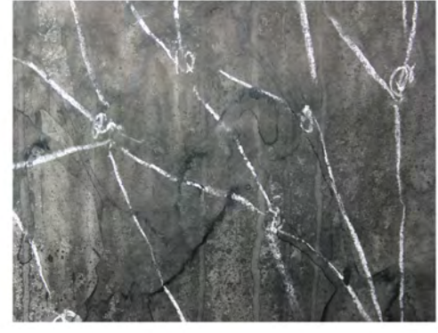
Clockwise from top left:

Massimo Guerrera, Partager les outils d'affection (Darboral) 1998-2008 (Photo courtesy of the Joyce Yahouda Gallery) Anne Macmillan, Heather's Coast 2009 (Photo courtesy of the artist) Audrey Nicoll, A Tragedy of Commons (detail) 2006 (Photo courtesy of the artist) Lucy Pullen, Double Meandering Line Drawing 2002 (Photo: Steve Farmer)